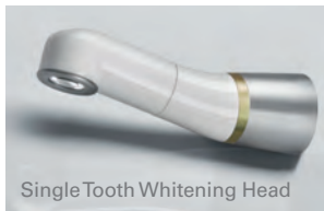
Single Tooth Whitening Head

Head design facilitates access in areas such as the distal side of the second molar compared to the 'Light guide Model' curing lights.